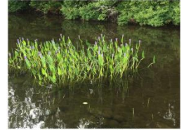
Pickerel-weed identified in Lake Manitou