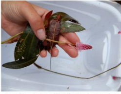
Amphibious Knotweed identified in Lake Horseshoe

We are very happy to announce that no exotic invasive aquatic plants were found in any of our four lakes! We strongly encourage you to continue the excellent work of protecting our lakes by inspecting and cleaning your boats, your trailers as well as your equipment. We ask you to continue to survey aquatic plants around your docks and especially to look out for invasive exotic aquatic plants.